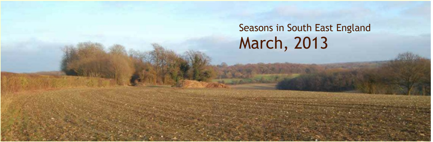
Above: Fields and hedgerows in the vicinity of Ash, Kent on March 2, 2013