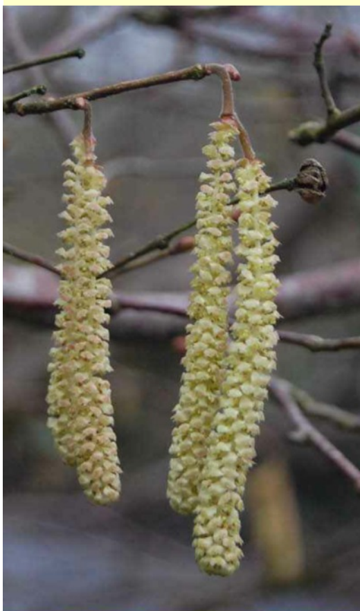
Left, top to bottom. Hazel catkins, March 17 (Saxten's & Cage's Wood, Kent). Sunset, March 20 (Ash, Kent). Daffodils, Belair Park, West Dulwich, London (March 20). Enlarging leaves of Arum , Saxten's & Cage's Wood (March 29).