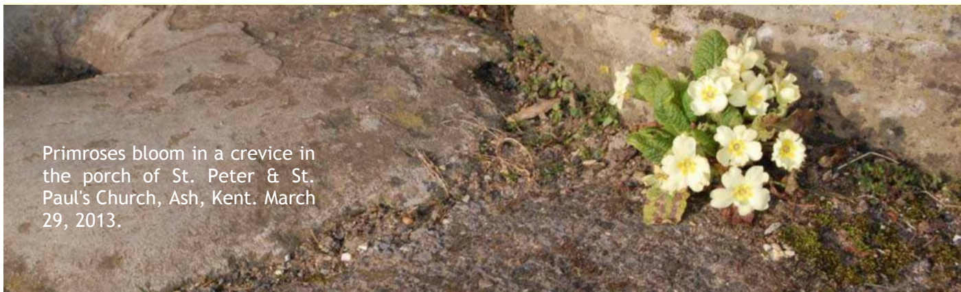
Primroses bloom in a crevice in the porch of St. Peter & St. Paul's Church, Ash, Kent. March 29, 2013.